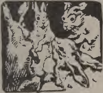
He Became Quite Angry.

D ADDY was certainly right on time this evening for his bedtime story, and he had a story he wanted to tell right away.